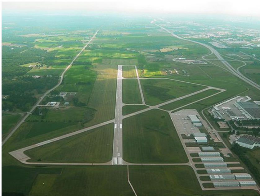
The Ankeny airport, the third busiest airport in the state, served about 40,000 corporate and private passengers last year. The 550-acre site on the city's south side has two runways that accommodate passenger and freight users.

"We're in (the) point of its evolution where we need to reinvest to accommodate additional aircrafts," Lord said.